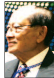
H.E. Fidel Valdez Ramos Chairman, Ramos Peace and Development Foundation, Inc., Muntinlupa City, Philippines

You have been very active not only in leading the Philippines on the road to prosperity but also in promoting the concept of "family" among Asian countries. In retirement from public office, you continue to devote great energy and much of your time to the same purpose. Could you share some of your thoughts behind the concept?