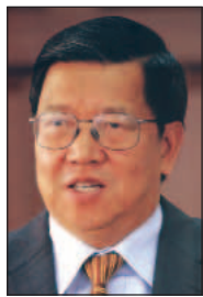
Long Yongtu Secretary-General, Boao Forum For Asia (BFA), Beijing

Leadership always begins with oneself, because it's necessary to attain self-mastery. If someone aspires to lead others, he must first be able to discipline and lead himself. His ideals and character will define his leadership. The principles he lives by, and the moral values he cherishes, will characterize the nature of his leadership. As a caring, sharing, and daring person, my life-long guidepost is that, regardless of one's religious beliefs, there is one Supreme Being who governs the affairs of people and nations, so that they treat each other as they would want to be treated. This is the universal "golden rule." ■